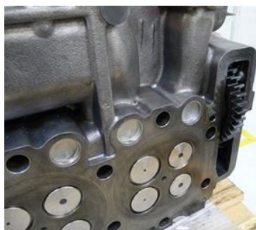
Cylinder-head sealing surface with spur gear

After a certain period of time, or as a result of damage, the engine may become severely impaired so that repairs are necessary. Extensive technical knowledge is necessary in order to restore the complex functionality of the engine as intended by the manufacturer. For example, the condition of the sealing surfaces of the engine block and cylinder-head has to be carefully checked before carrying out each step. In many cases they can only be restored to optimum condition through precise, mechanical working of the sealing surfaces. This process must be carried out by a specialized firm with the appropriate machinery and expertise. The constructional design of the valve control with spur