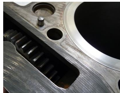
Engine block sealing surfaces with spur gear

gears in the cylinder-head and the engine block (see images) make it necessary for the material removed as a result of the mechanical working of the sealing surfaces to be compensated by means of a correspondingly thicker cylinder-head gasket.