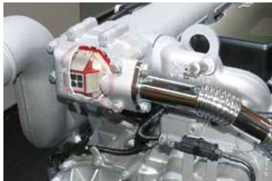
Nonreturn valve at the engine (visually cut open)

In doing so, they perform surrounded by aggressive exhaust gas condensate their heavy duty at temperatures up to 180° C.