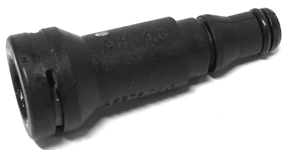
Clutch Delay Valve

If the pedal becomes hard during the bleeding process, do not force the pedal down. This can overstroke the CSC and cause damage to the CSC and clutch. The hydraulic line that comes out of the bleeder adapter has a Clutch Delay Valve (CDV) on the end. Remove this piece and simply connect the line straight into the bleeder adapter and try again. This will not affect the operation of the clutch, but will improve the feeling of the clutch pedal actuation.