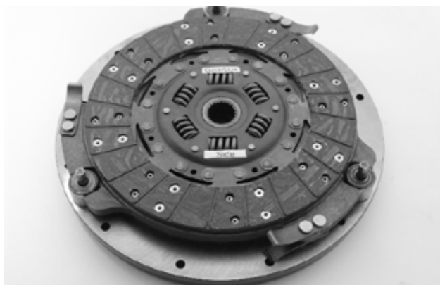
Fit second clutch disc. Closely note direction of hub and clutch disc used. 'Gearbox Side' sticker faces pressure plate.