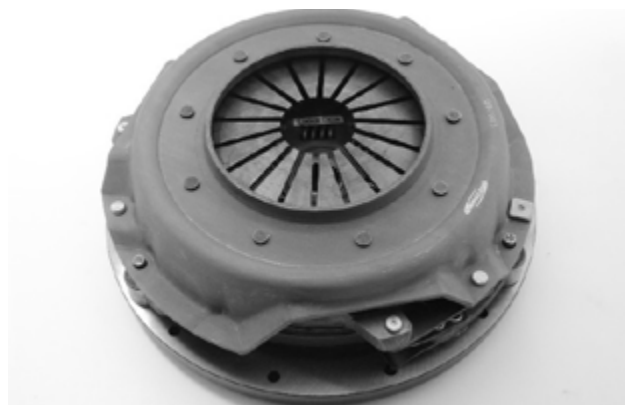
Clutch pressure plate is fitted. The use of aligning tool ACTCP23 is recommended when fitting clutch to vehicle.