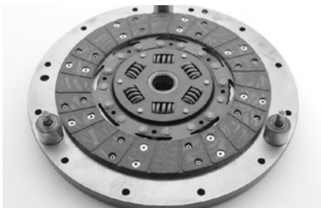
Flywheel side clutch disc fitted in direction shown. Closely note direction of hub and disc used. 'Engine Side' sticker faces Flywheel.