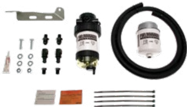
Example of Fuel Manager Kit for Isuzu D-Max / MU-X