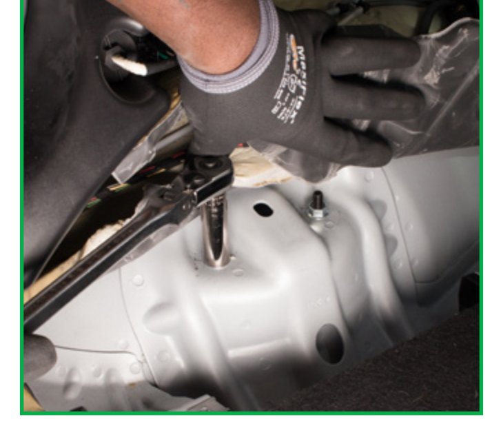
FIGURE 10-5 FIGURE 10-6

4 SK-3567 Installation Manual REV 01 October 20, 2022