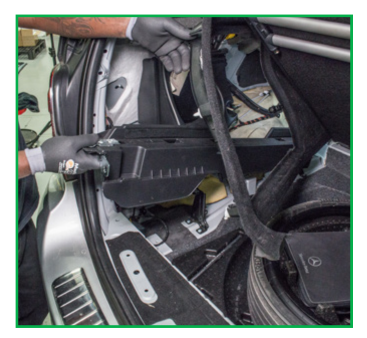
FIGURE 10-3 FIGURE 10-4

6. With the trim panels removed, lift the insulation to gain access to the top mount nuts. Loosen and remove. (FIGURES 10-5, 10-6)