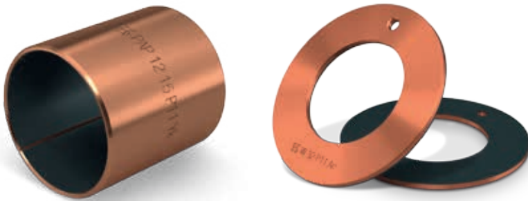
PERMAGLIDE® plain bearing bush design PAP ... P11 and thrust washer design PAW ... P11