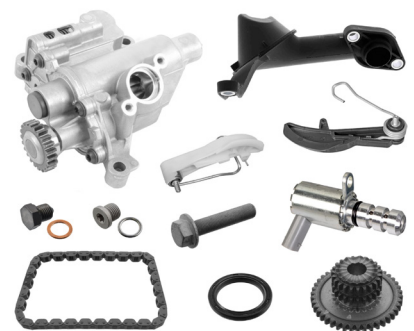
Oil pump set with complete periphery