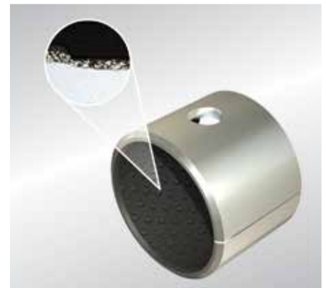
P20 plain bearing with oil distributing pockets and oil hole

The materials P20, P22 and P23 contain lead and must not be used in the food sector.