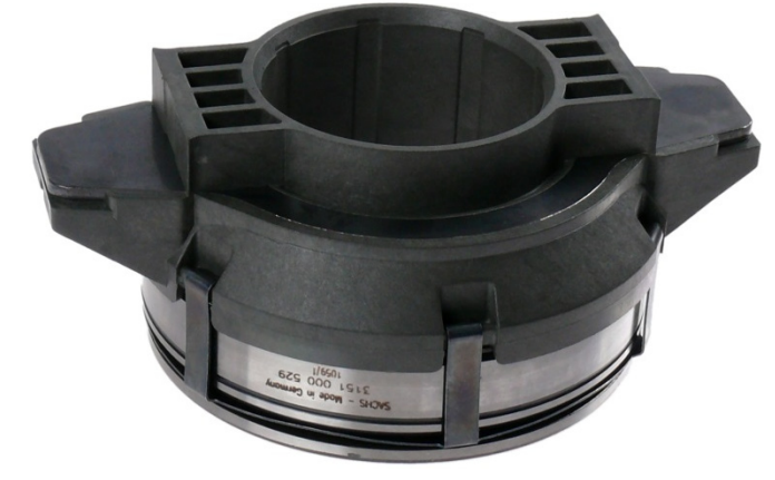
Fig. 1: Releaser with metal body