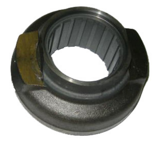
Fig. 4: Releaser with plastic slide sleeve

Due to advances in technology, releasers with metal slide sleeve (Fig. 3) will be superseded by releasers with plastic slide sleeve (Fig. 4).