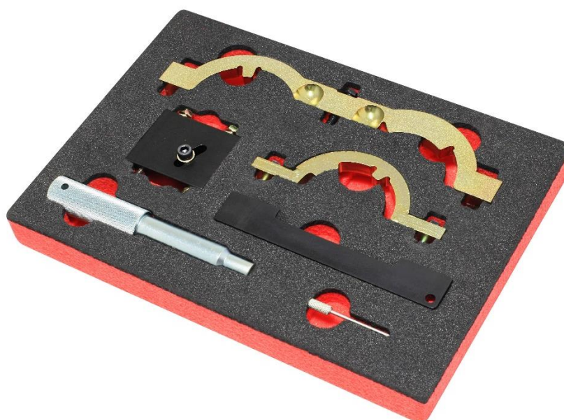
7468-11325 – GAT5090 – Engine Setting and Locking Tool Kit