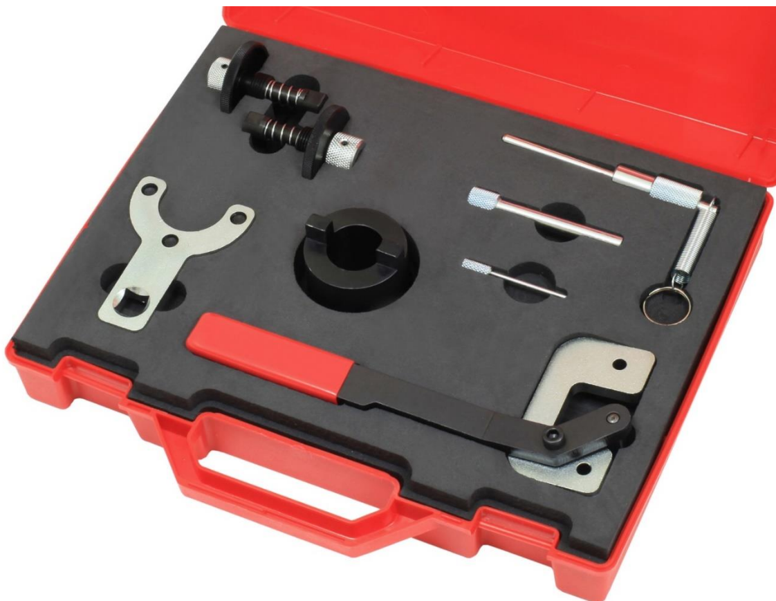
7468-11324 – GAT5080 – Engine Setting and Locking Tool Kit