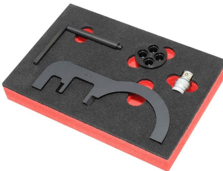
7468-11317 – GAT5010 – Engine Setting and Locking Tool Kit