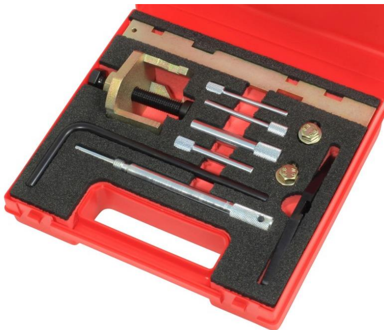
7468-10038 – GAT4830 – Engine Setting and Locking Tool Kit