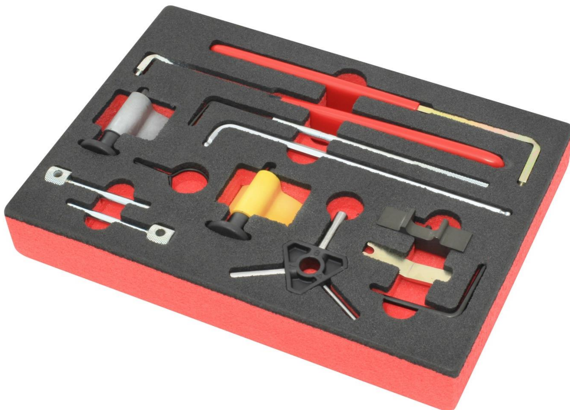
7468-11263 – GAT4840A – Engine Setting and Locking Tool Kit