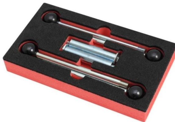
7468-10065 – GAT4741 – Front End Support Set