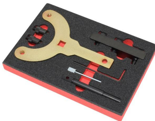
7468-11329 – GAT5210 – Engine Setting and Locking Tool Kit