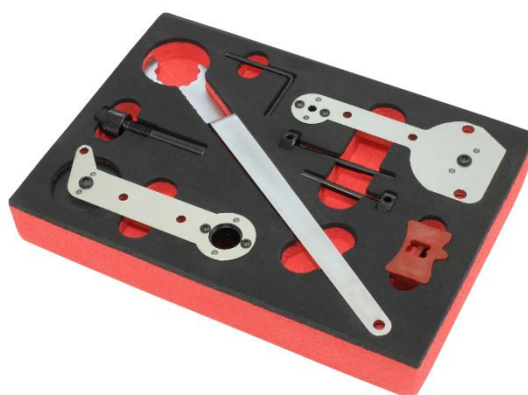
7468-11287 – GAT5145A – Engine Setting and Locking Tool Kit