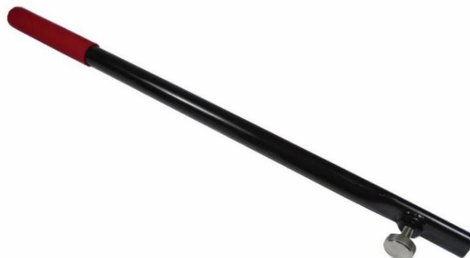
1468-11253 – GAT4939 – Universal Handle for Crankshaft Pulley Holding Tool