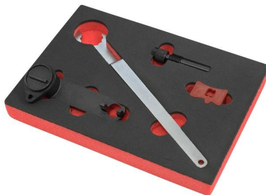
7468-10504 – GAT5140 – Engine Setting and Locking Tool Kit