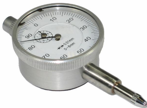
7468-11195 – GAT3054-10 – Dial Test indicator