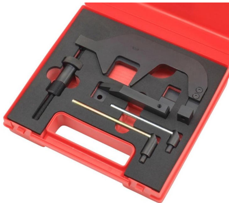
7468-11332 – GAT5220A – Engine Setting and Locking Tool Kit