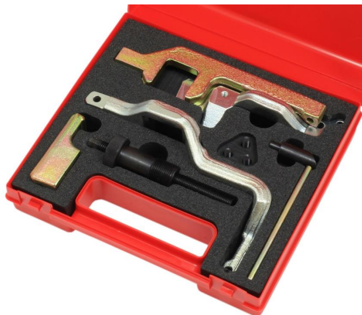
7468-11320 – GAT5020 – Engine Setting and Locking Tool Kit