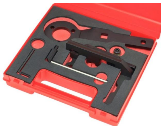
7468-12001 – GAT5148A – Engine Setting and Locking Tool Kit