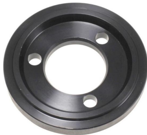
7468-11290 – GAT5257 – Crankshaft Seal Installer