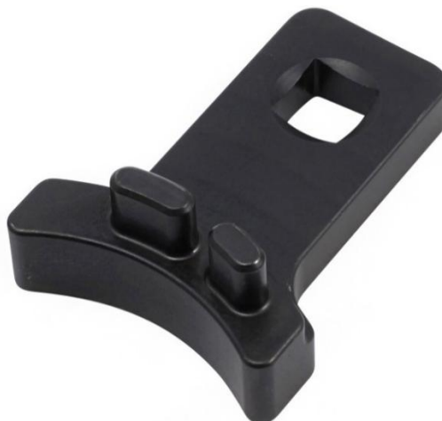
7468-11400 – GAT5259 – Camshaft Sprocket Holding Tool