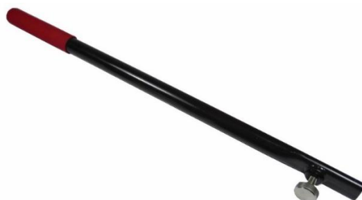
7468-11253 – GAT4939 – Universal Handle for Crankshaft Pulley Holding Tool