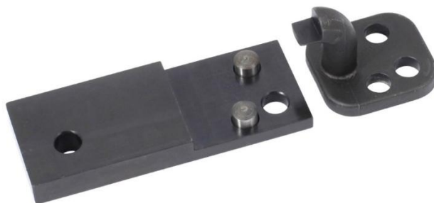
7468-11308 – GAT5299 – Camshaft Locking Tool