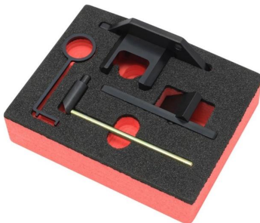
7468-11283 – GAT5255 – Belt-In-Oil Timing Check Kit