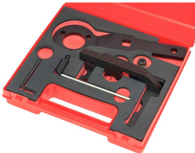
7468-12001 - GAT5148A - Engine Setting / Locking Tool Kit