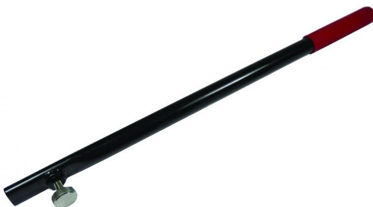
7468-11253 - GAT4939 - Universal Handle for Crankshaft Pulley Holding Tool