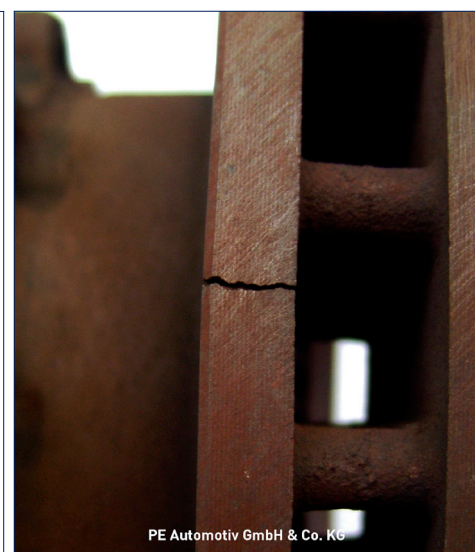
PE Automotiv GmbH & Co. KG