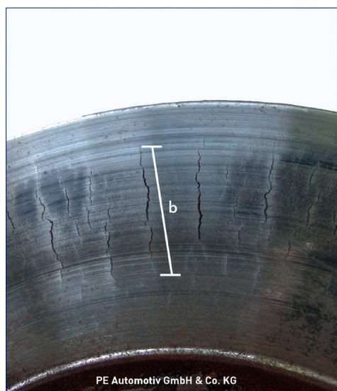
PE Automotiv GmbH & Co. KG

Brake disks under increased thermal load (crimson colouring of cooling duct) No cracks through to the cooling duct Replace both brake disks on an axle if there are any.