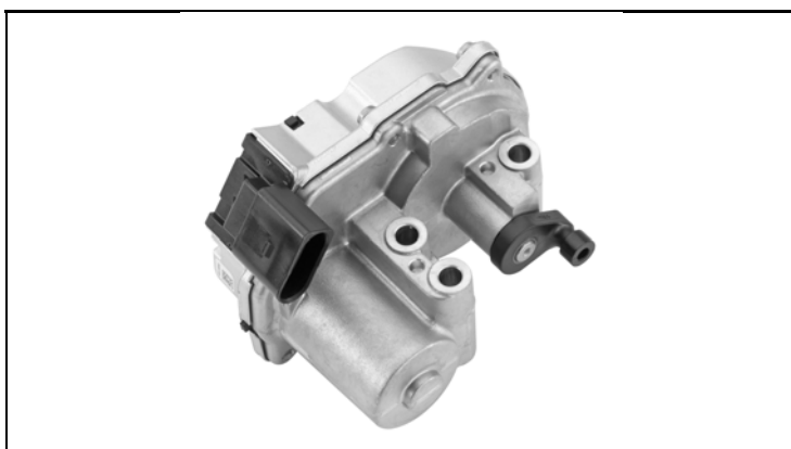
1 - Produkt / Product