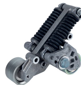
Old version with coil springs

One example of a different design is febi 171022 Belt Tensioner, suitable for the most common Mercedes-Benz Actros IV, Antos and Arocs trucks, as well as Travego buses. The old version of the belt tensioner which utilised two coil springs was replaced by the new version of febi 171022 which uses a torsion spring. Technically, there are no advantages or disadvantages of either design in practice and they can be interchanged without any problems.