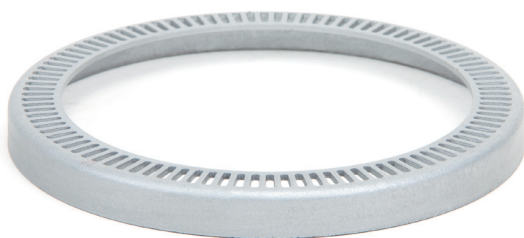
ABS sensor ring 434 0498 10

When changing a wheel bearing on vehicles equipped with ABS, it is not strictly necessary to replace the sensor ring. However, if the ABS sensor ring is damaged, it must be replaced.