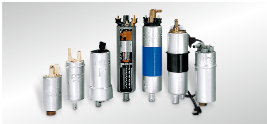
Fig. 14: fuel pumps and fuel in-tank modules, different versions

The components used for this purpose are classified under the term “fuel system”.