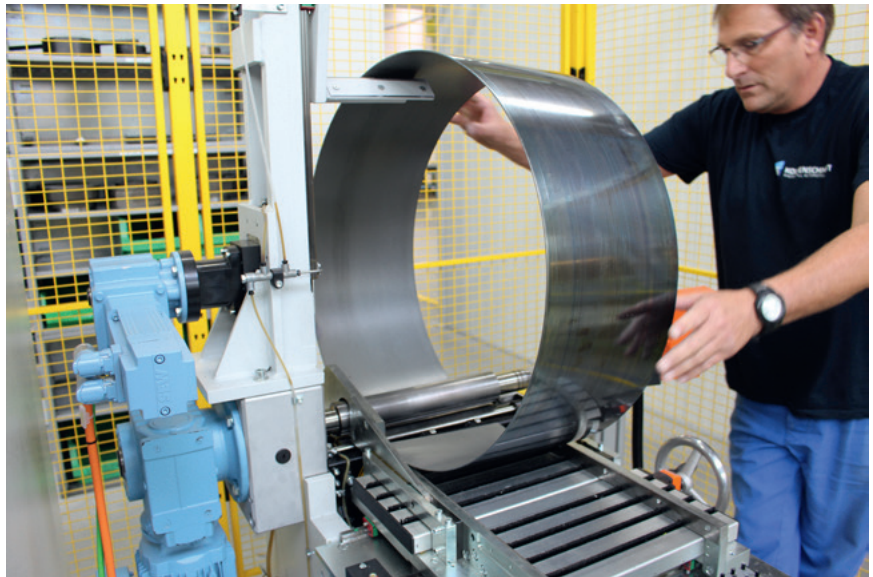
Plain bearing production

Sheets made from KS PERMAGLIDE® materials are processed into bushes with a custom diameter or into thin-walled large bushes with low space requirements. The sheet sections are shaped into plain bearing bushes on roller bending machines. The nominal wall thickness of the KS PERMAGLIDE® sheets is usually 2.5 mm and can be between 1 and 3 mm depending on production-related aspects. The sheets are up to 236 mm wide. The sliding-surface coated sheet material is available as coilware. This means that the length of the sheets and the diameter of the bushes produced are variable. Due to the manufacturing process, rolled bushes have a joint.