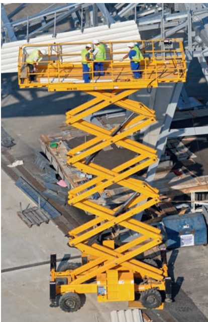
Work platform with scissor joints

Bearings in a scissor joint with Permaglide® plain bearing bush in design PAP ... P200