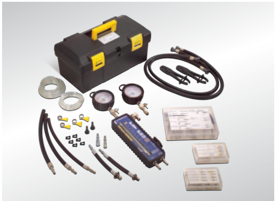
Fuel pressure test kit