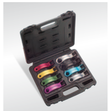
Set of tools for fuel pressure test kit

Set of tools for fuel pressure test kit (4.07373.21.0) for opening quick connectors