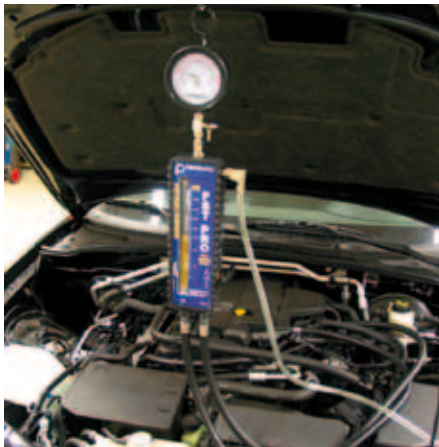
Use in vehicle

The test device is normally connected directly in the stream of fuel. An installation point located along the fuel supply line close to the fuel rail permits for example precise measurement of the fuel pressure and flow rate within the rail.