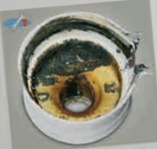
Fig. 18: A sectional view of the housing of an E3T toothed ring pump, clagged with debris