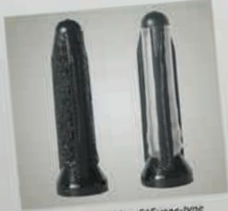
Fig. 22: Sieve filter of an E1F vane-type pump. Left: clogged - Right: new