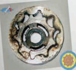
Fig. 19: A jammed pump system (trocholdal toothed ring) of an E3T toothed ring pump