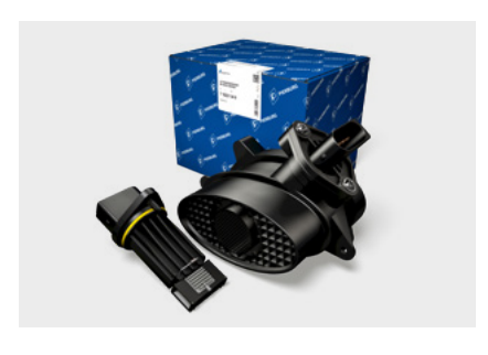
Whether as a plug-in probe or with a flow tube: Pierburg air mass sensors measure with the highest precision.