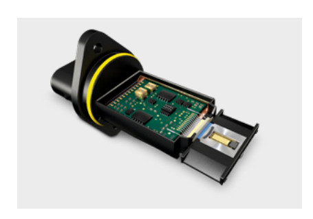
Not just a "sensor", but also accumulated intelligence (sectional view).

The increasingly more stringent requirements for environmental protection ensured that the new generation of air mass sensors became more and more precise. Pulsations and return flows can also be detected in designs with two separate measurement bridges.