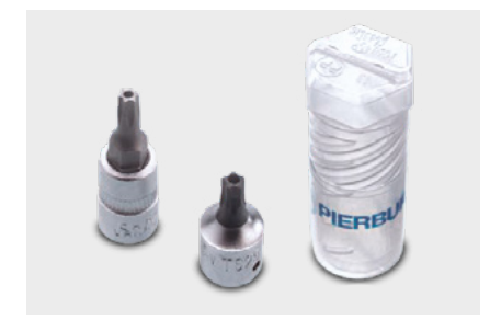
A toolkit for loosening special screws that are installed as standard.