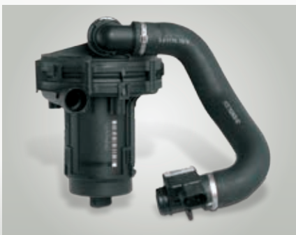
The secondary-air is injected by a high-speed secondary-air pump.

With the benefit of many years of experience as an OE supplier, PIERBURG can offer a compact and efficient pollution control system.