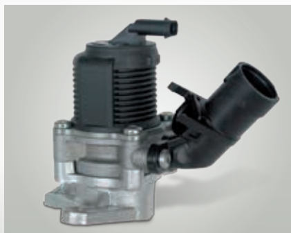
The future belongs to OBD-monitored solenoid secondary-air valves.