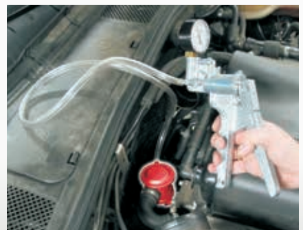
Pneumatic components are easily checked using simple tools.