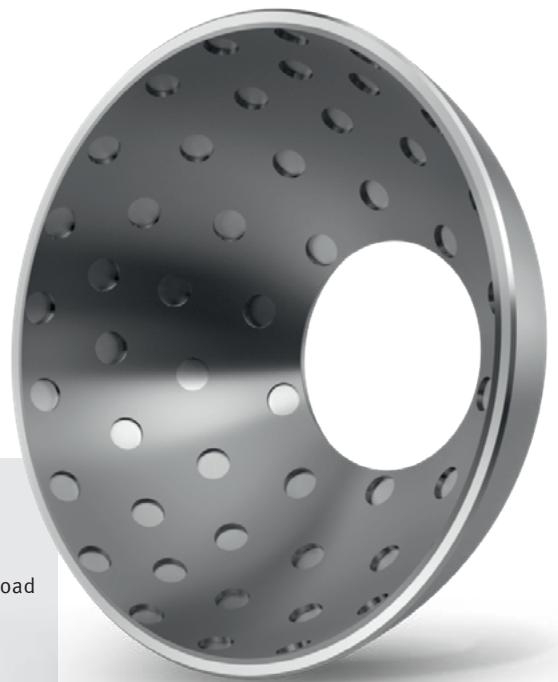
KS Permaglide® plain bearing spherical shell design P200