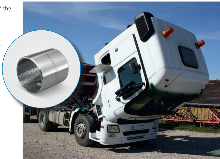
Bearing with KS Permaglide® plain bearing bush design PAP ... P200