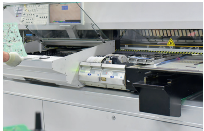
Automatic placement machine

In the application, the bearing of the sliding guidance was achieved with 2 maintenance-free sliding strips made from the material KS PERMAGLIDE® P10. The slide glides smoothly and jerk-free on the strip and can thus be positioned extremely precisely.