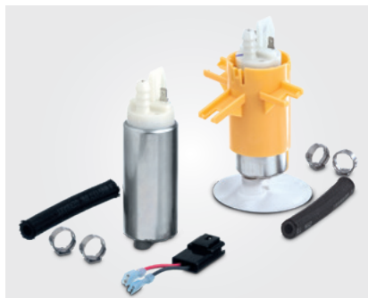
If required, the necessary auxiliaries are included with the spare parts kits