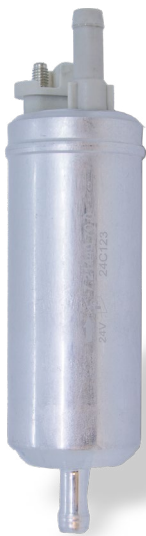
Fig. 1: E1F fuel pump for diesel