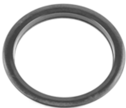
ORIGINAL PLASTIC ROUND BEARING CONTACT

Failure to fit this ring may cause clutch operation issues or damage to the slave.