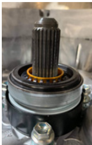
ORIGINAL PLASTIC ROUND BEARING CONTACT