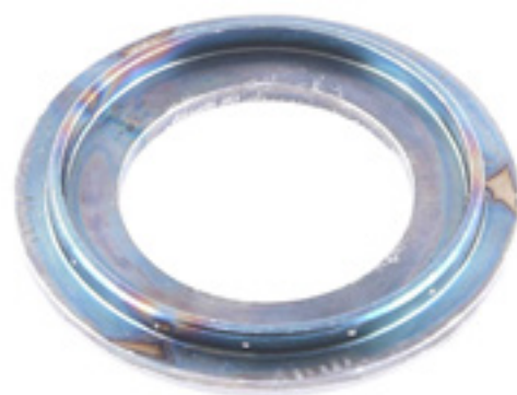
REVISED STEEL FLAT BEARING CONTACT