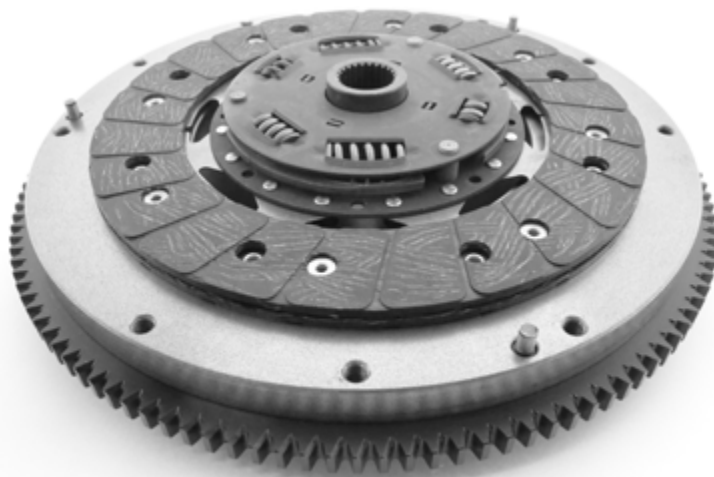
Flywheel showing 3 available holes for pressure plate bolts.

*Please be aware the different number of pressure plate bolts will not affect operation of the clutch in any way.