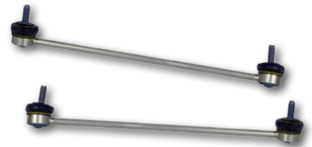
AST4121 & AST4117

During fitment, applying stabilisers to the correct side is essential to prevent premature failure. Here's a quick guide for identifying their differences.