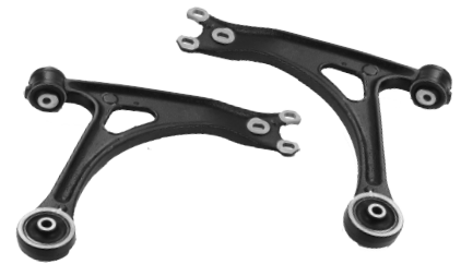
AST2663 & AST2664

When replacing the lower ball joints and wishbones on certain Audi models - including the 1998-2006 Audi TT - It is important to consider and pay attention to the design and geometry adjustments. Here's a quick guide to help you identify and fit the Audi TT compatible wishbones we stock.