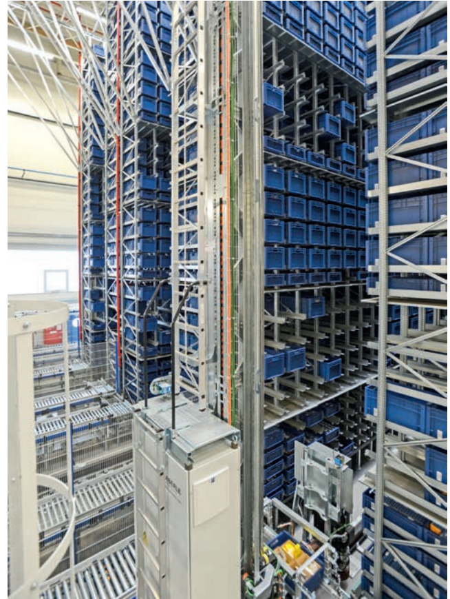
High bay lift trucks

KS Permaglide® catalogue, item no. 50003863-02