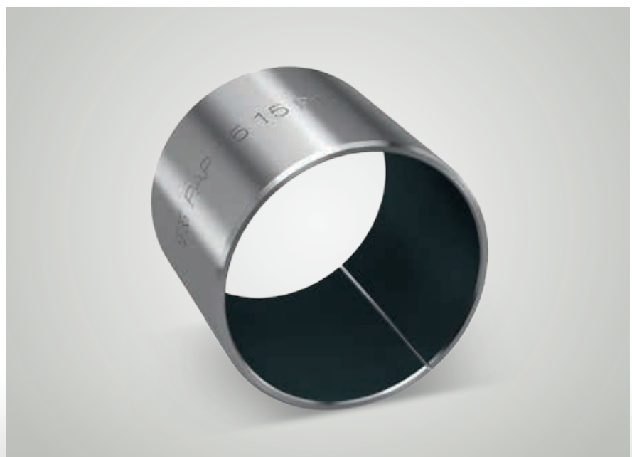
PERMAGLIDE® P10 plain bearing bush