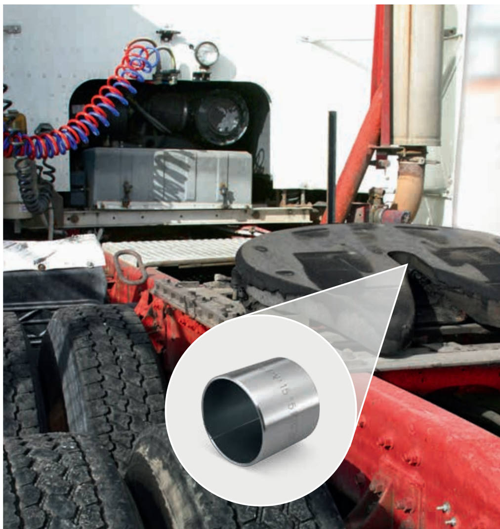
Bearing in fifth-wheel coupling with PERMAGLIDE® P10 plain bearing bushes

The fifth-wheel coupling is subjected to impacts, vibrations, dirt and moisture during travel. For the bearing in the fifth-wheel coupling, plain bearings must be robust and highly stressable and work smoothly even if the fifth-wheel coupling is not used frequently.