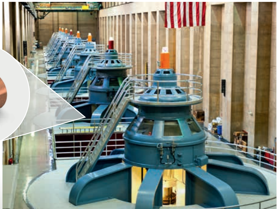
Turbine Hoover Dam