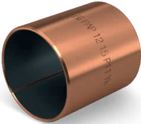
KS PERMAGLIDE® plain bearing bush design PAP ... P11